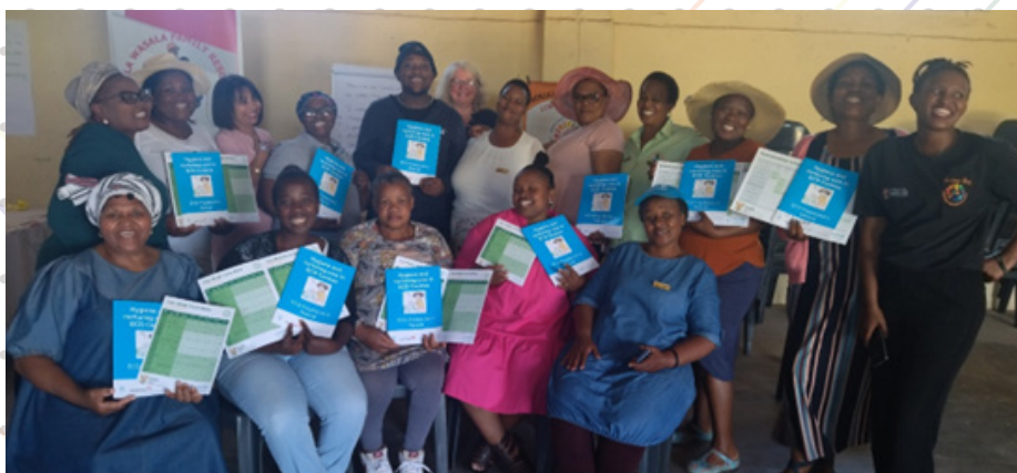
Above: ECD Practitioners were trained by local CBOs on handwashing, immunisation, growth and development monitoring, nutrition, and responsive caregiving.

Congratulations to ITEC for successfully leading this project in the Eastern Cape and Ntataise Trust for implementing in the Free State.